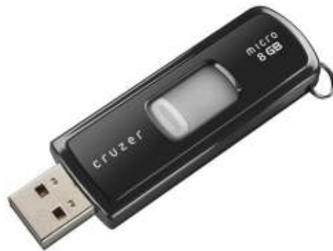
8 GB Cruzier Thumb Drive