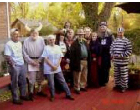
SSNA Halloween Party: Characters welcome