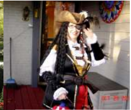
Watch yer step there, Matey, 'r ve be walking the plank!