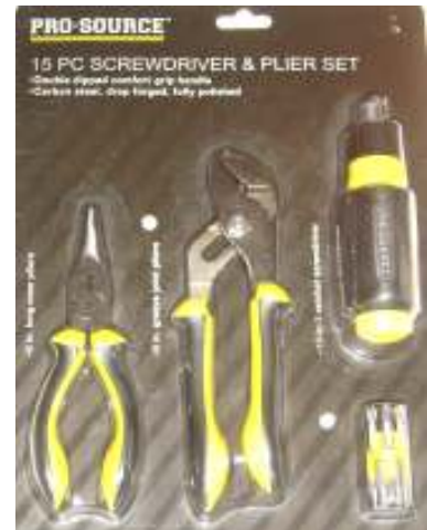
ProSource 15 pc pliers and screwdriver set

One of our lucky attendees at Sunday's meeting will win their choice of prizes shown above. Our set of 20 storage containers will make storing leftovers a snap! Or choose the high-capacity 8 GB thumb drive to back up files on your PC. Or, choose the versatile 15-piece pliers and screwdriver set. Congratulations to Karen Mullen of Second Street who won the five-piece serving set at the October meeting.