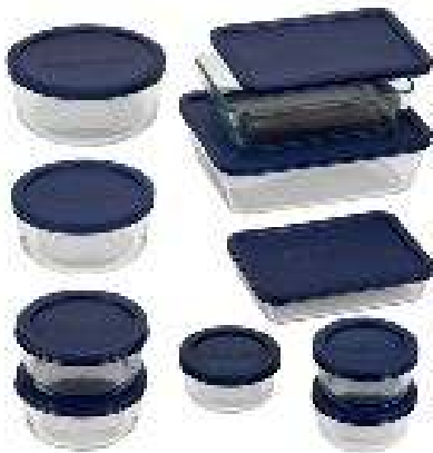
20 pc Food Storage Containers & Lids