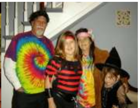
The Hippie family